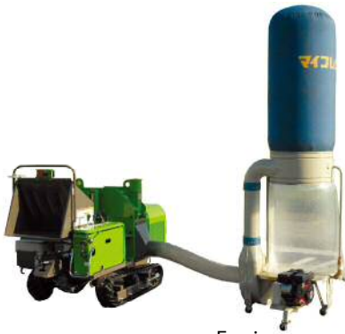
Engine mounted type