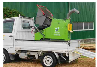
Able to load on a light truck or trailer