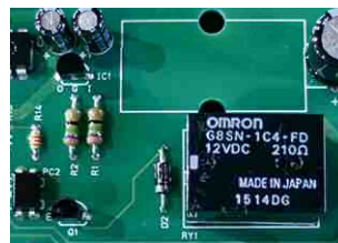
No stress micro-computer