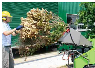
Leafy branches OK