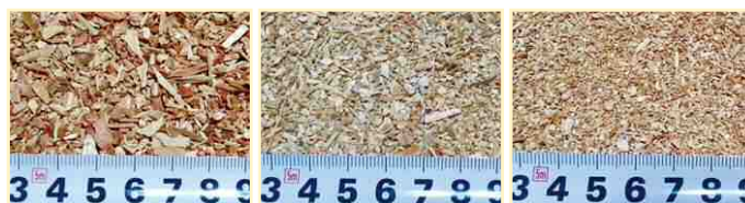
5mm holed screen

Different chip sizes suit different purposes. Choose the hole size of screen based on your needs.