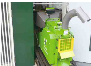
Only 72cm wide!